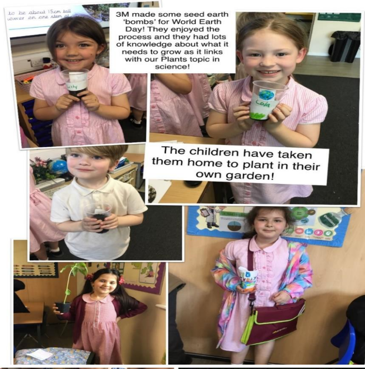
3M made some seed earth 'bombs' for World Earth Day! They enjoyed the process and they had lots of knowledge about what it needs to grow as it links with our Plants topic in science!