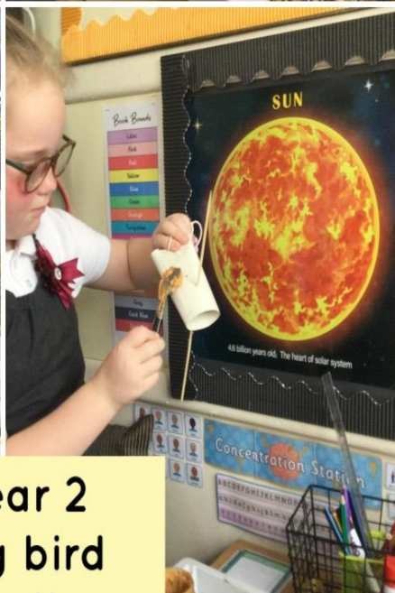
For World Earth Day, year 2 made bird feeders using bird seed, card and peanut butter.